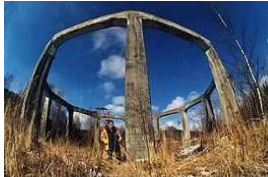
The Nazi Bell: No evidence remains other than this abandoned test-rig...or does it?

Our goal was to make a case for the idea that Einstein’s Unified Field Theory played a role in the development of both the Nazi Bell project as well as the US Navy’s Philadelphia Experiment during the Second World War.