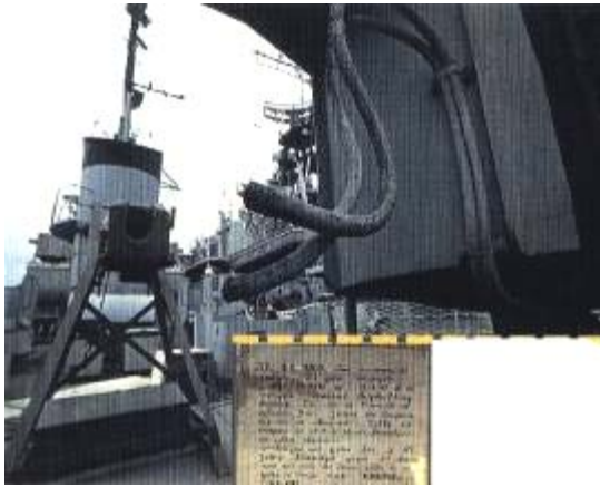
The Eldridge: Power-cables from the Phil. experiment are still visible 50 years later.