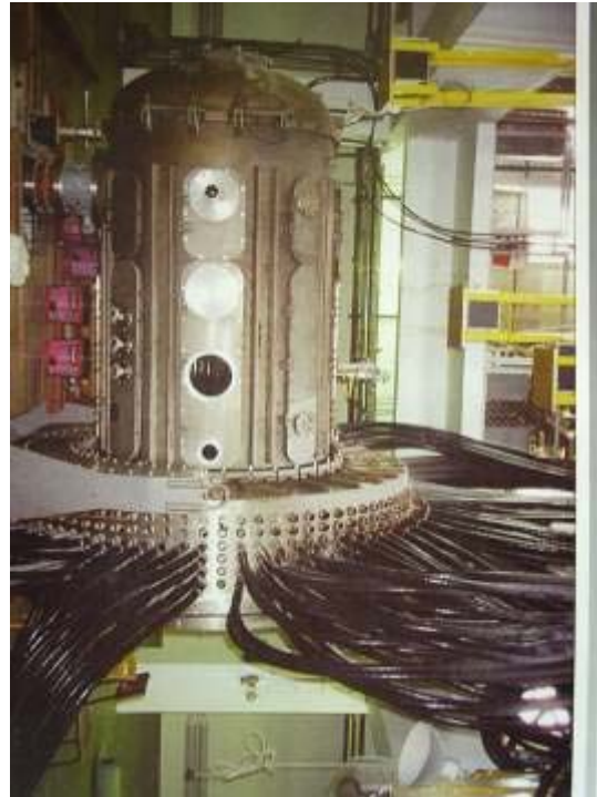
Plasma Focus: Witkowski suggested that the Bell was similar to this fusion device.

It's important to remember that the Bell project was completely compartmentalized – that's why they placed it at Wenceslas Mine. Because of this isolation, the story remained untold until Igor Witkowski stumbled across it while following up on a Polish folk-tale about what was basically a “ghost-mine” that the locals had been afraid of since the war.