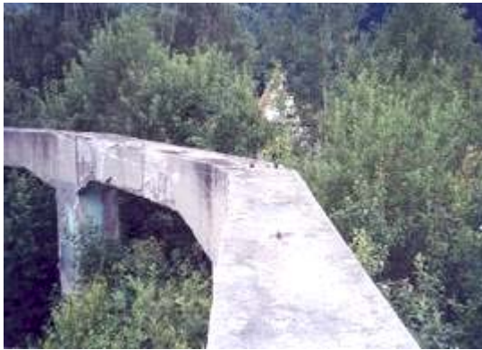
Test-Rig Top: Another shot of the top of the Bell rig from the anonymous source.

Whatever the post-war research might have been, the contemporary research seems to surpass: SARA tested their mini-version of the Bell and found that it effectively produced a gravitational back-EMF that they couldn't shield against. That's important, because SARA does electromagnetic shielding on the B-2 bomber....they tried everything imaginable before realizing that it was a time-space distortion effect. They shut the experiment down when ISSO funding dried up, although the claim is that if the cash is available, they still have the unit ready & waiting for more tests.