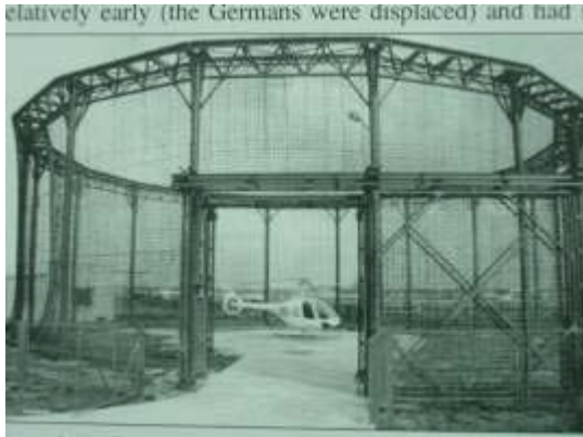
The Flytrap: A modern-day equivalent of the Bell test-site, used for helicopter testing.

Dering didn't elaborate much on the Rhine Valley experiments, except to say that they also incorporate something called "Zenic" or "Zinsser" surface-waves (can't remember which). These are apparently a very efficient method of transmitting electricity through